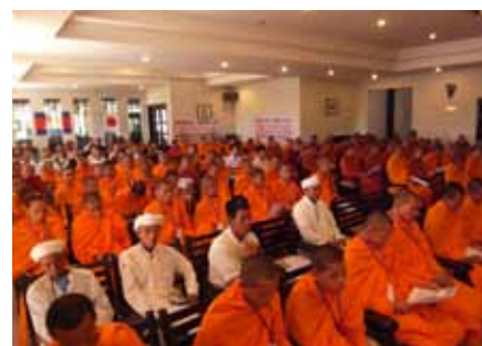
Stupa being constructed