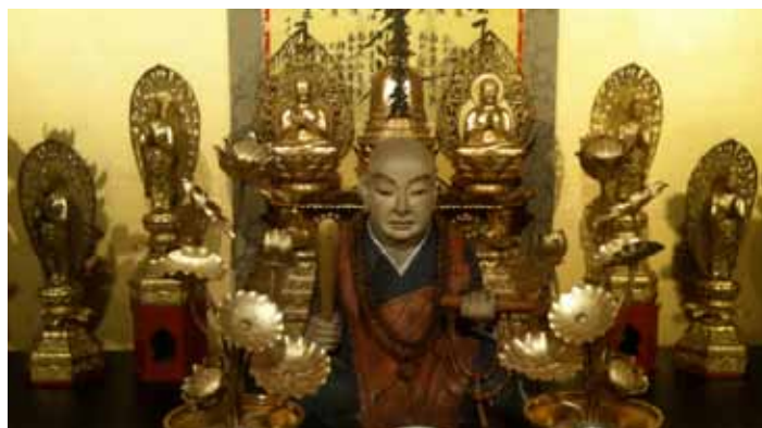
Temple friends enjoying themselves in the courtyard

Europe (and will again in autumn before the snowy wintry weather comes upon us once again).