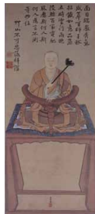
Lotus Sutra in miniature scripture, preserved at Kokuzenji Temple, Hiroshima

attain Buddhahood in the future. It is as if a great harvest had been reaped in autumn, leaving nothing more than gleanings for the Nirvana Sutra." Thus the Nirvana Sutra itself implies that it is inferior to the Lotus Sutra.