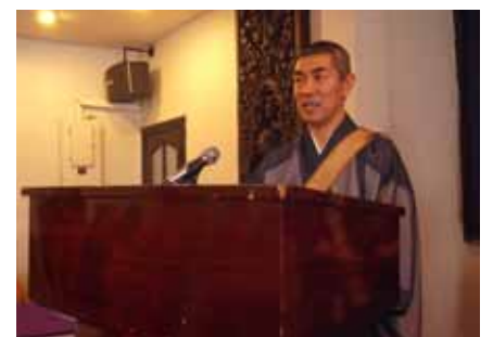
Stupa being constructed