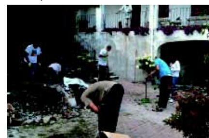
Members volunteering work for the temple