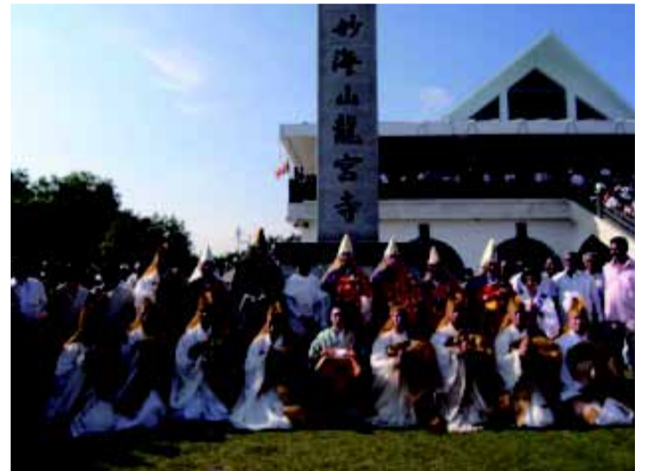
Priests from Japan in front of Ryuguji Temple

Over 100,000 attendees crowded the temple premises to join in the service and chant the Odaimoku in unison. Eleven years have passed since "Namu Myoho Renge Kyo" was introduced to this region. The Buddha's wish for the happiness of all mankind has rooted itself in this land.