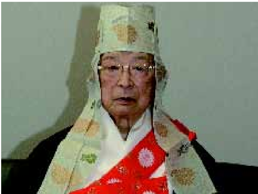
Archbishop Nisso Uchino