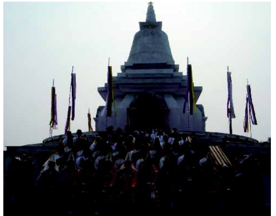
Several venerable priests from Japan in front of the Stupa