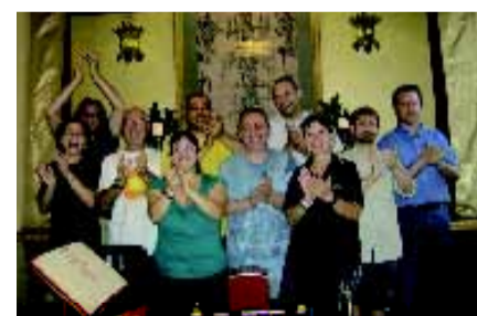
Renkoji members in front of the Gohonzon