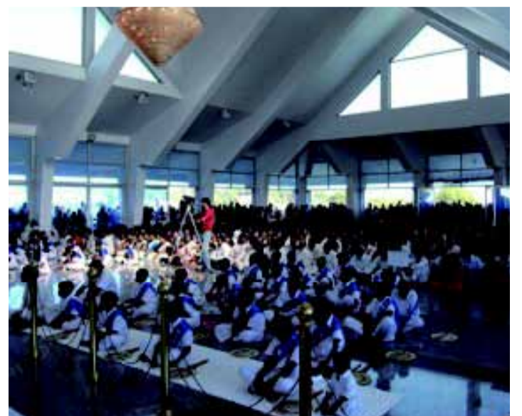
Priests and attendees fill the Main Hall