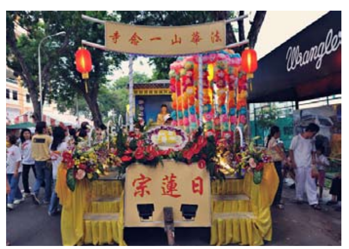
Nichiren Shu float adorned with flowers and lanterns