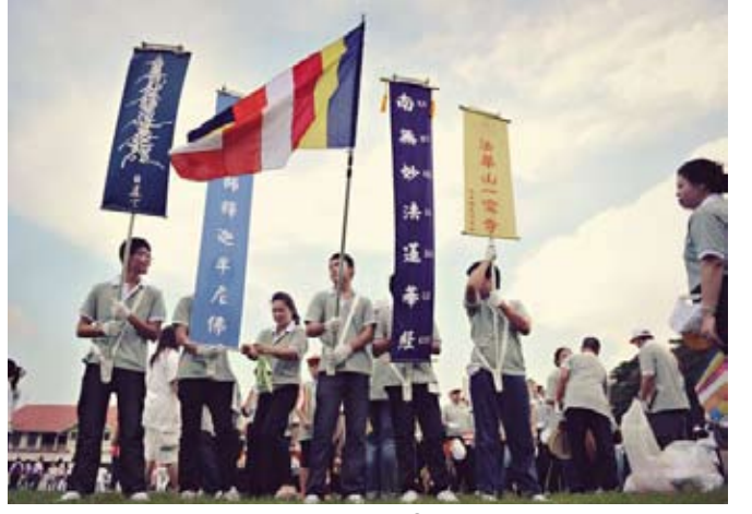
Wesak procession holding Odaimoku banner

Thanks to the sincere contribution of many members, family, and friends Ichinenji had a successful Wesak Day event. We do wish to make Wesak Day parade our big annual activity so that the Lotus Sutra and Odaimoku can reach the Malaysian people's heart quickly through our Bodhisattva practice.