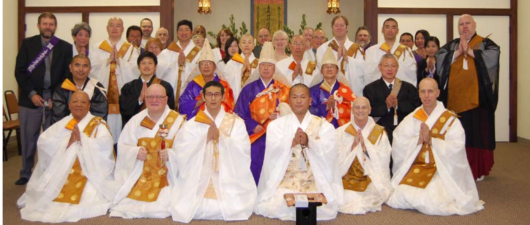
Ministers and members of NONA gathered in front of the NBIC altar