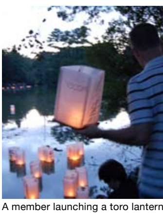
into the lake

The lantern festival was a wonderful way for the Sangha to end the Obon season and share the Dharma with others. Throughout the afternoon and evening members of the Sangha talked to people and answered questions about Buddhism, Odaimoku and the Lotus Sutra.