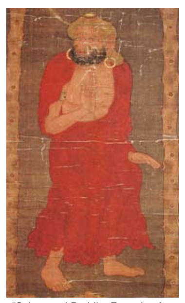
"Sakyamuni Buddha Emerging from the Mountains," preserved at Kyoto Honkoku-ji Temple

In its 8th chapter, he mentioned that faith in the Lotus Sutra is most important, and meditation is the important practice which helps it, too. A simple tomb of only three bamboos exists in Fukakusa now. (to be continued)