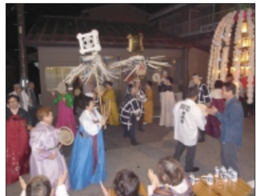
Participants join the mando parade at Minobusan