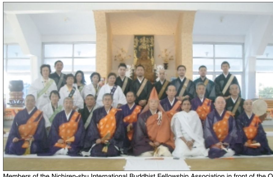
Members of the Nichiren-shu International Buddhist Fellowship Association in front of the O-mandala, Dragon Palace Temple