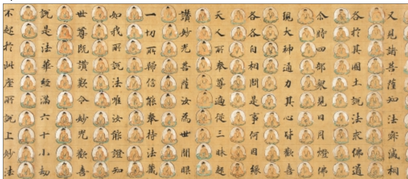
The Lotus Sutra with a Buddha Image Accompanying Each Character: In this national treasure of Japan, chapter I of the Lotus Sutra written on a scroll, an image of the Buddha accompanies each Chinese character. It is preserved in the Zentsuji Temple, Grand Head Temple of the Zentsuji Group of the Shingon Shu Buddhism in Kagawa Prefecture. Measuring 29.4 cm by 2,124.2 cm, it is believed to have been made in the middle of the Heian Period.