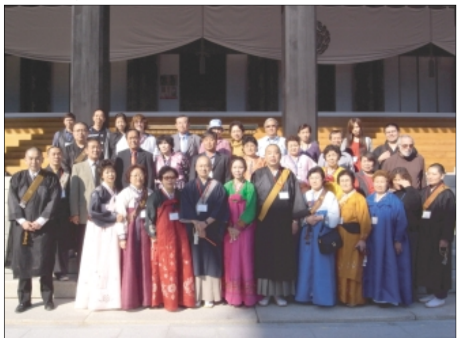
Participants and staff in front of the main hall of the Kuonji Temple