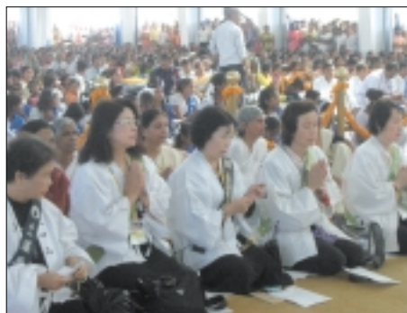
The main hall is fully packed with devotees