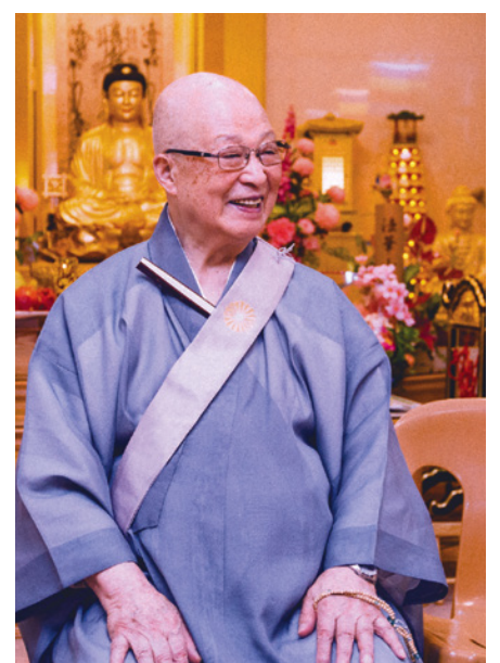
The Archbishop thoroughly enjoyed his first visit to Southeast Asia. His visit to Ichinenji Temple, and especially the opportunity to personally meet the members, was a happy experience for him. He was truly touched by their sincerity and enthusiasm.