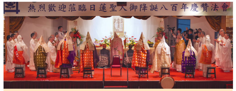
About 40 priests assisted with the celebration ceremony.