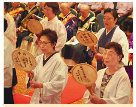
20 women from Wasan groups came from Japan.