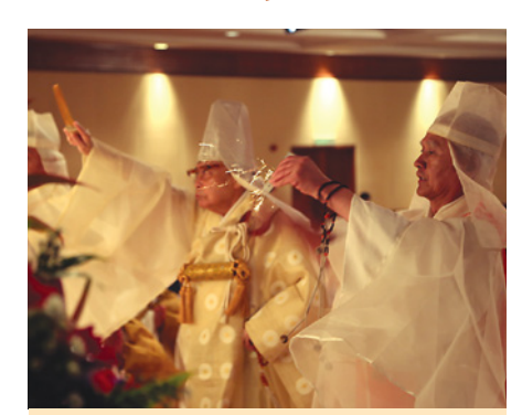
Shuhoshi priests performing a Kito blessing.