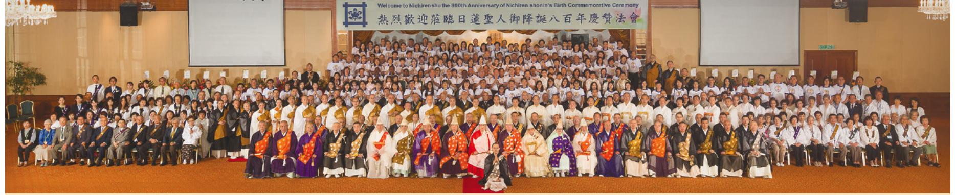
Over 400 people attended the celebration, including Archbishop Nisso Uchino, a large contingent of priests and members from Japan and the U.S., and members of all seven Southeast Asia Sanghas.