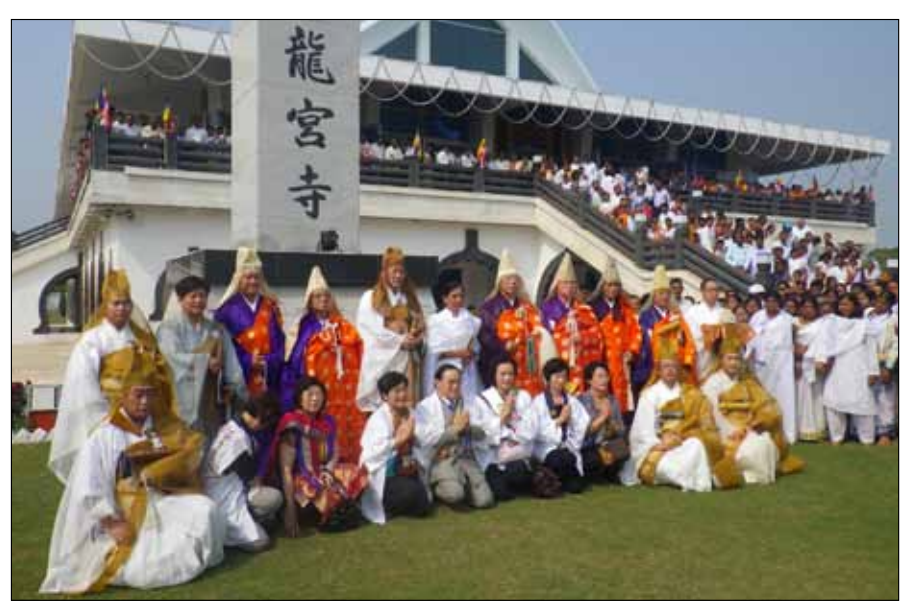
Priests and followers from Japan in front of Dragon Palace Temple