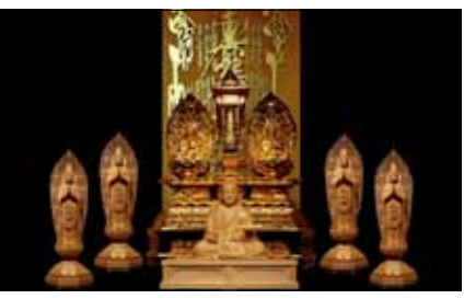
Itto-Ryoson-Shishi (picture 1)

The Sacred Title, "Namu-myoho-rengekyo" written in Chinese characters is put in the center. Sakyamuni Buddha is on the left side and Many-Treasures Buddha on the right. Furthermore, the Four Great Bodhisattvas are lined up surrounding them as attendants of the Buddhas. The Buddha statues configured from the mandala are called "Itto-Ryoson-Shishi