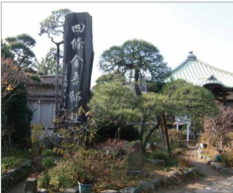
The historic site of Shijo Kingo's house