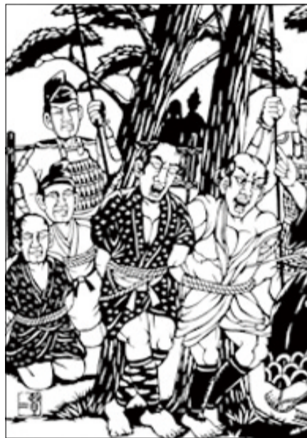
The Atsuwara Persecution