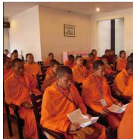
Theravada monks chanting