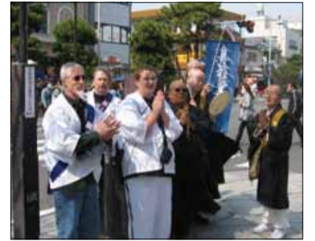
Pilgrimage group chanting on the street corner in Kamakura

To practice as the Buddha practices means to practice as an enlightened being. When we chant the Odaimoku, we are being enlightened. And we are enlightening others. Even if we believe that we are stupid, submissive, distracted or clumsy, it does not matter. Even if the world rejects us because we do not meet their standards, it does not matter. We do not have to pass a qualifying examination to practice Buddha Dharma. The Buddha tells us to chant the Odaimoku with confidence and faith as we are, however imperfect that may be. That is enough. (to be continued)