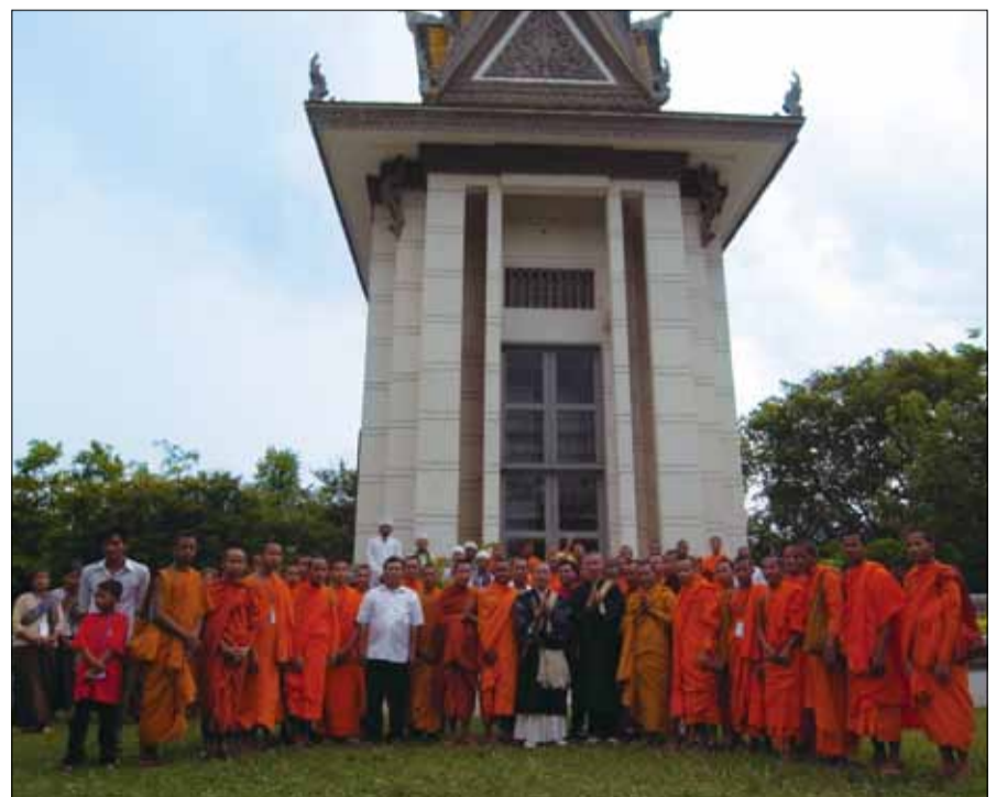
Paying respects at the Killing Fields Memorial