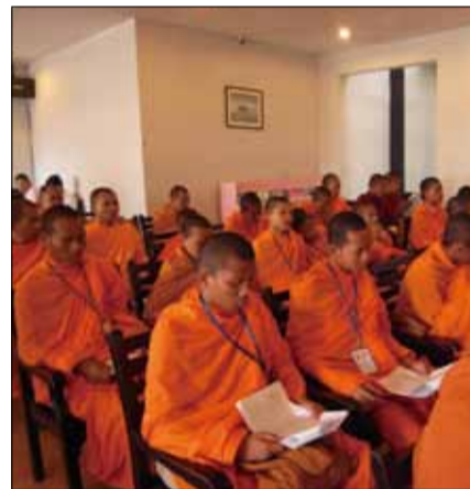
Theravada monks chanting